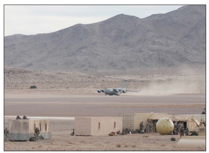
A C-17 Globemaster III aircraft takes off following air-lands on the objective secured by a joint forcible entry operation for Operation Dragon Spear at Fort Irwin on 6 August 2015.

jumper exited a high-performance aircraft — the first air-land package arrived. With added mobility and firepower from high mobility multipurpose wheeled vehicle (HMMWV) gun-trucks. MRZR all-terrain vehicles, and Stryker Infantry Carrier Vehicles (ICVs), they would assist in expanding the lodgment around the newly created aerial port of debarkation (APOD). The faster they expanded the security perimeter around the landing strip, the sooner they could introduce even more combat power in support of coalition forces conducting operations to restore the international boundary between Atropia and Donovia. Over the next 24 hours, the paratroopers would successfully conduct offensive operations at four separate urban population centers in support of coalition objectives. A prepared enemy may have been able to defeat a single light infantry task force, but surprise was on the side of the paratroopers. The enemy security forces simply couldn't react fast enough to the introduction of so much combat power in such a short amount of time.